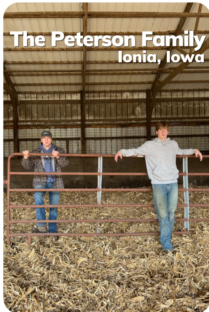
The Peterson Family Ionia, Iowa